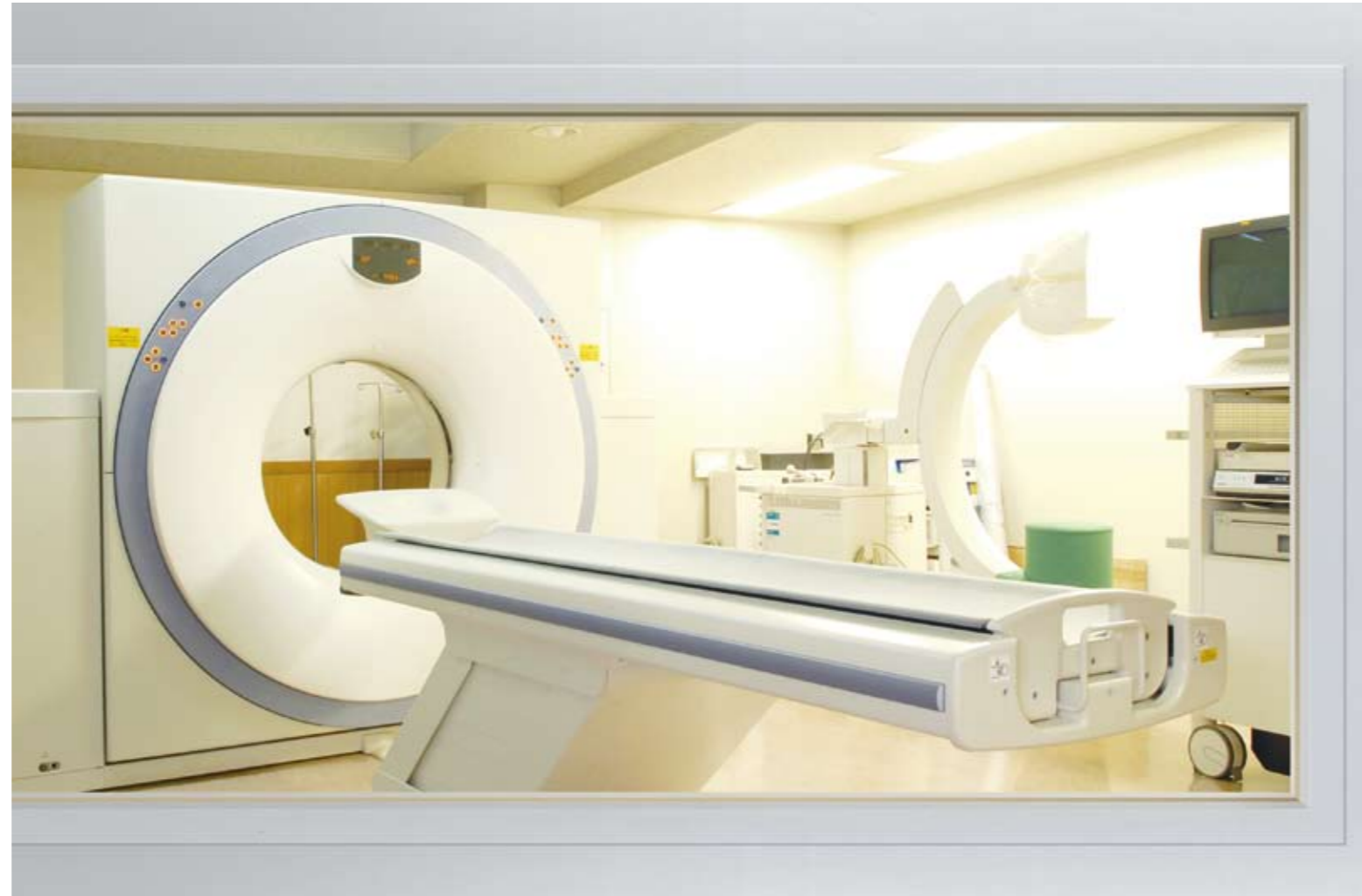
Viewing window for CT room