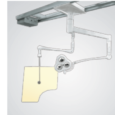
Fixed barrier for X-ray radiation shielding system