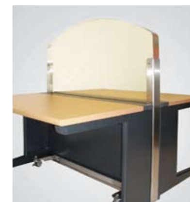
PET counseling desk