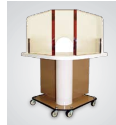
FDG administration radiation shielding table