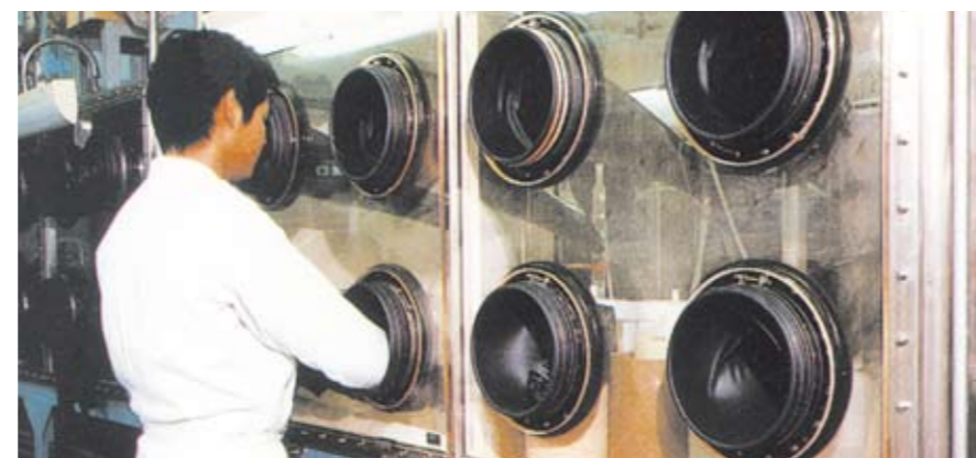
Front panel of glove box