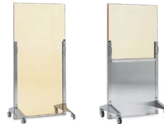
Mobile barriers for radiation shielding